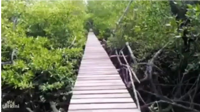
Figure 6. Bridge in Mentawir