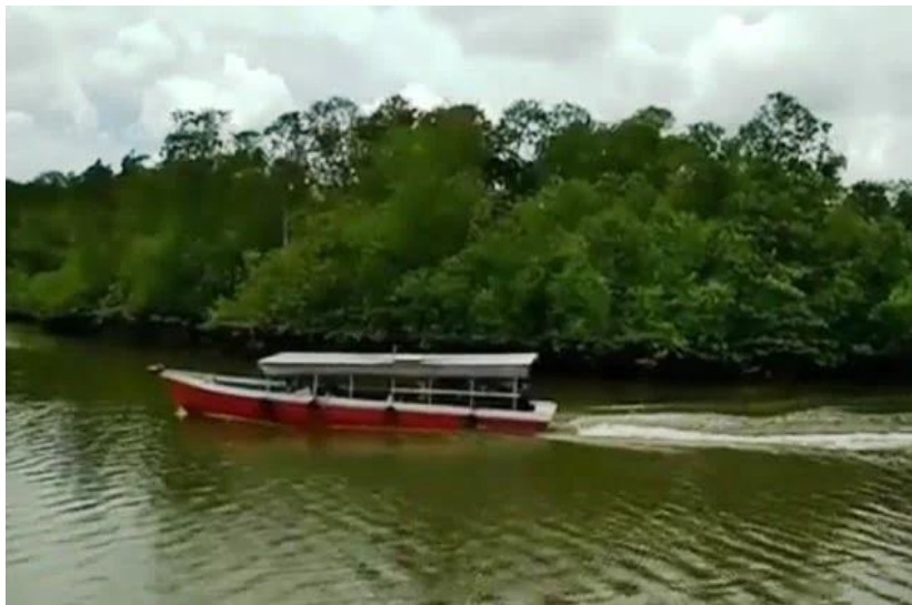
Figure 5. Mangrove Trees

Mentawir Village's mangrove forest for 900 meters. When stepping on the wooden path, the cool air immediately envelops the skin of the body, providing an unforgettable refreshing sensation. The lush green mangrove branches not only create a cool and cozy atmosphere, but also add a charming natural beauty. The melodious sound of birds chirping, as if a chorus of nature's music, adds a magical and alluring impression to a visit to Mentawir mangrove village. Thus, the experience of walking through the mangrove forest of Mentawir Village is not only a feast for the eyes, but also stimulates the senses of hearing and touches the soul, making it one of the main attractions that distinguish this village as a special tourist destination.